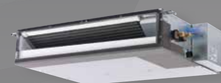
Horizontal-ducted indoor unit