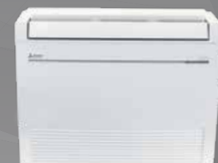
Floor-mounted indoor unit