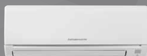
Wall-mounted indoor unit